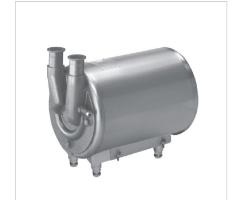
自吸泵 Self-priming Pump