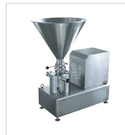
水粉混合机 Water - Powder Mixer