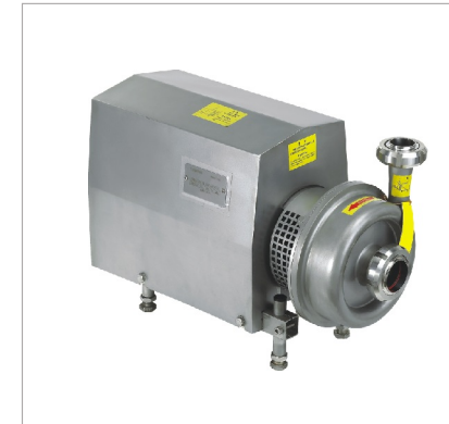
卫生级离心泵 Sanitary Centrifugal Pump