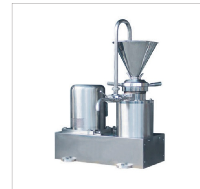
胶体磨 Colloid mill