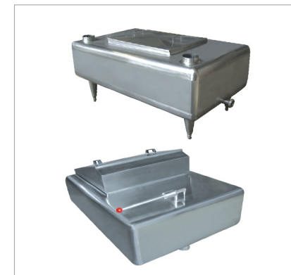
奶槽 Milk Weighing Tank