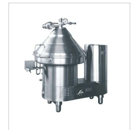
净乳分离机 Milk Separator