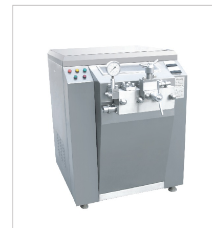
高压均质机 High pressure homogenizer